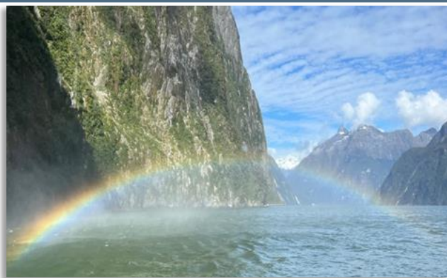
Above: Tips #1,2,4,5